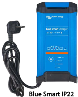
Blue Smart IP22 12/30 (3)