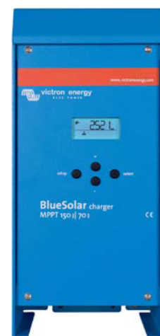
150/70 & 150/85 CAN-bus