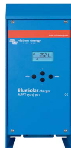
150/70 & 150/85 CAN-bus