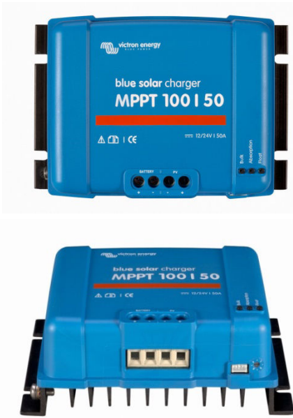
Solar Charge Controller MPPT 100/50