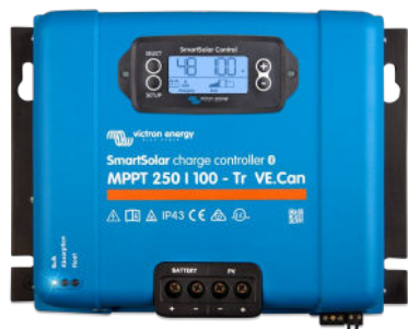
SmartSolar Charge Controller MPPT 250/100-Tr VE.Can with optional pluggable display