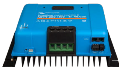
SmartSolar Charge Controller MPPT 250/100-Tr VE.Can without display