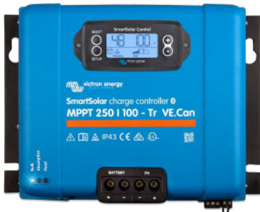
SmartSolar Charge Controller MPPT 250/100-Tr VE.Can with optional pluggable display