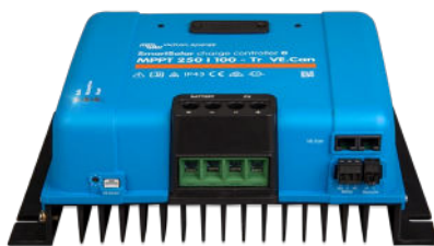
SmartSolar Charge Controller MPPT 250/100-Tr VE.Can without display