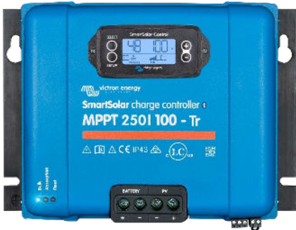
SmartSolar Charge Controller MPPT 250/100-Tr with optional pluggable display