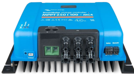
SmartSolar Charge Controller MPPT 250/100-MC4 without display