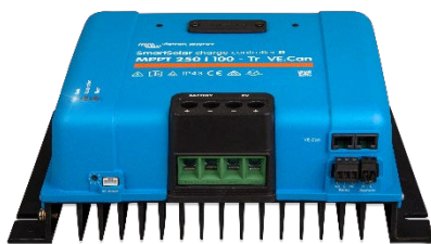
SmartSolar Charge Controller MPPT 250/100-Tr VE.Can without display