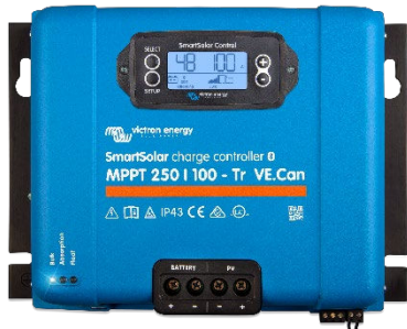
SmartSolar Charge Controller MPPT 250/100-Tr VE.Can with optional pluggable display