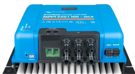
SmartSolar Charge Controller MPPT 250/100-MC4 without display