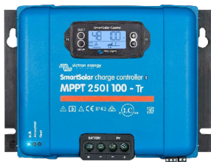
SmartSolar Charge Controller MPPT 250/100-Tr with optional pluggable display