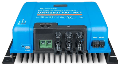
SmartSolar Charge Controller MPPT 150/100-MC4 without display

Simply remove the rubber seal that protects the plug on the front of the controller, and plug-in the display.