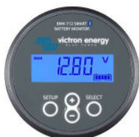
Bluetooth sensing: BMV-712 Smart Battery Monitor