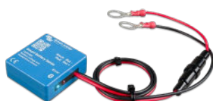
Bluetooth sensing: Smart Battery Sense