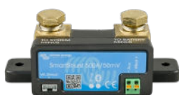
Bluetooth sensing: SmartShunt