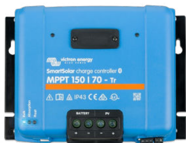
SmartSolar Charge Controller MPPT 150/70-Tr without optional display