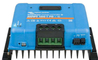
SmartSolar Charge Controller MPPT 150/70-Tr with optional display