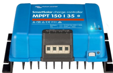
SmartSolar Charge Controller MPPT 150/35