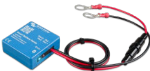
Bluetooth sensing: Smart Battery Sense