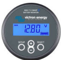
Bluetooth sensing: BMV-712 Smart Battery Monitor