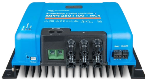
SmartSolar Charge Controller MPPT 150/100-MC4 without display