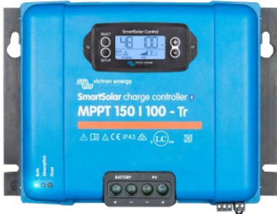
SmartSolar Charge Controller MPPT 150/100-Tr with optional pluggable display