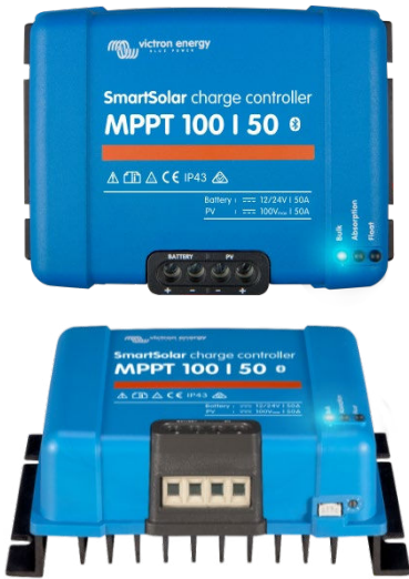
SmartSolar Charge Controller MPPT 100/50