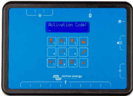
SHS 200 – Front view Keypad and LCD screen