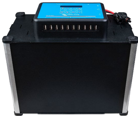
SHS 200 – mounted on optional battery box