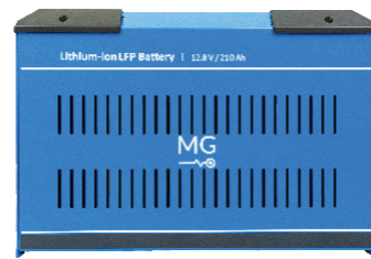
LFP battery modules 12.8 V - 2.7 kWh

This robust battery is based on the next generation LiFePo4 chemistry. The advantage of this next generation chemistry is the higher energy density. The modules are very compact and light weight with high charge and discharge capability. The 12.8 V LFP series can be used for applications in various markets such as mobile and marine. Scalable and reliable battery banks can be created while keeping the ease of installation and the minimum use of external components.