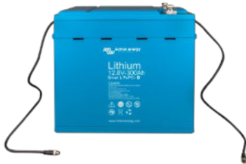
12,8V 300Ah LiFePO 4 Battery

Very useful to localize a (potential) problem, such as cell imbalance.