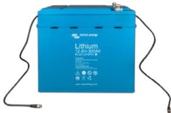
12,8V 300Ah LiFePO 4 Battery

With Bluetooth cell voltages, temperature and alarm status can be monitored. Very useful to localize a (potential) problem, such as cell imbalance.